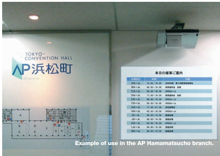
Example of use in the AP Hamamatsucho branch.