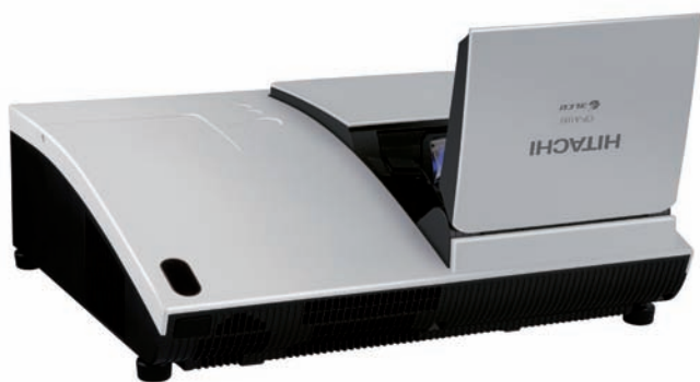
Ultra-short throw LCD projector CP-A100

Realising the importance of projectors, the AP Hamamatsucho branch, which has been a key branch in the Tokyo region since it opened in April 2008, installed projectors and screens in every room, except for small conference rooms. It purchased seven CP-X605s and installed them in each conference room, with central operation from a control room.